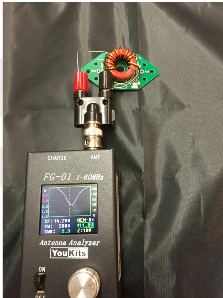
Photograph shows a trap being tested

The traps can now be tested using an antenna analyser. Thread a piece of wire through the centre of the toroid and connect it to your analyser. The resonant frequency of the trap will be indicated with a pronounced and sharp dip in the SWR reading. The actual reading is not important – it's the frequency of the dip that matters.